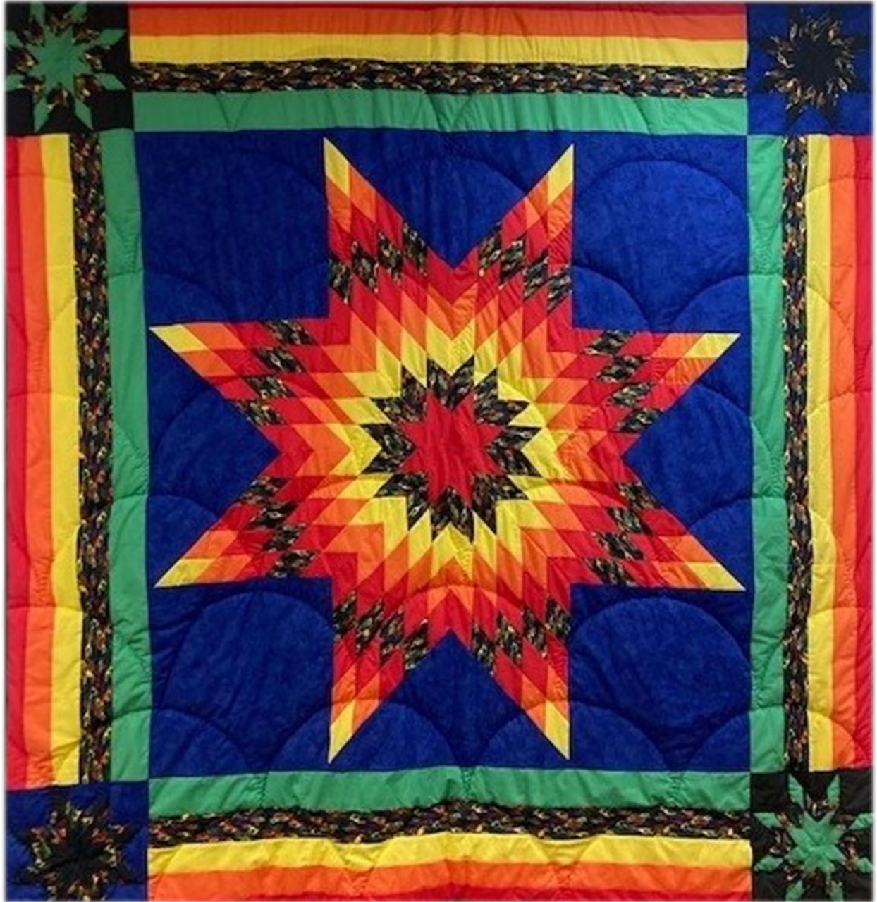
Star quilt presented to OPI by Hays Lodge Pole Elementary School (2004)